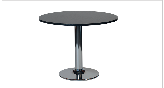
TABLE: „TISCH NINO LOW“